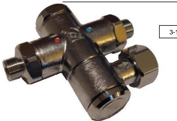
Mixing valve 3/8" compression inlets 1/2" NPT outlet