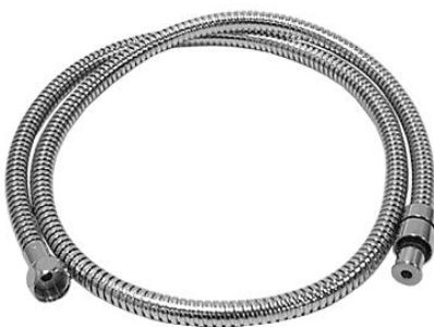
59" FLEXIBLE HOSE